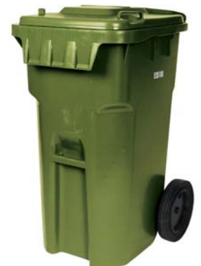
64 US gal/240 L Model # 60213

MAKES COLLECTION EASIER. Universal system design (USD).